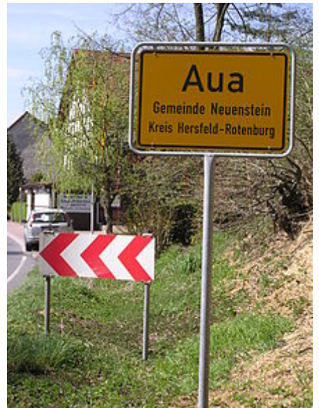
Entrance of Aua

Retrieved from " https://en.wikipedia.org/w/index.php?title=Aua_(Neuenstein)&oldid=919847106 "