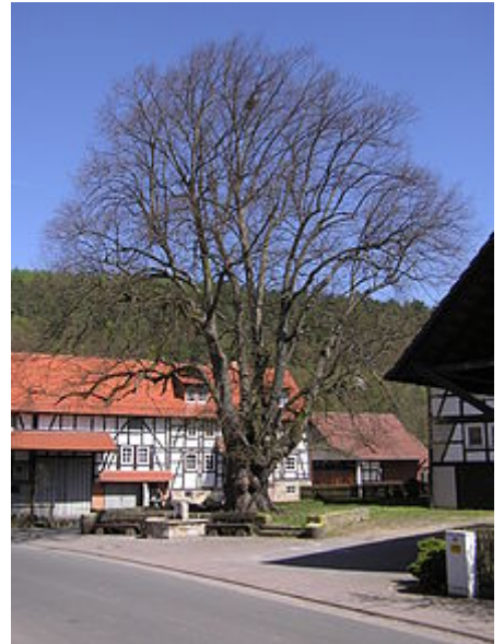
The village's tilia, roughly 1200 years old